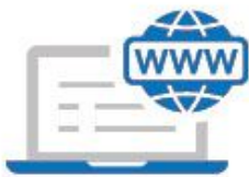
WEBSITE & CMS