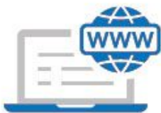
WEBSITE & CMS