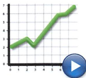
Student Success Zone